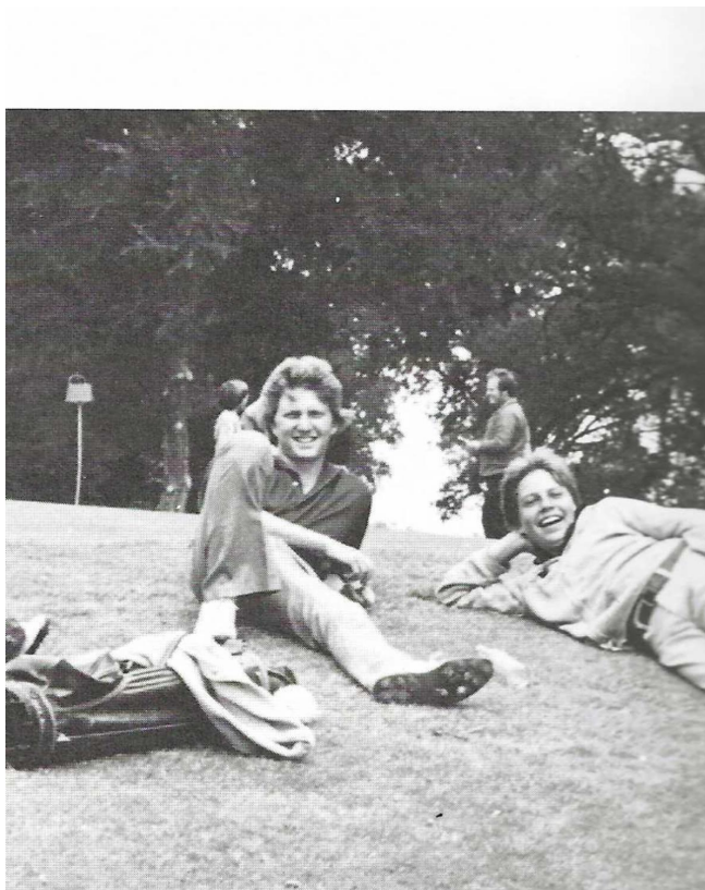
Alumni Find #1_July 2020