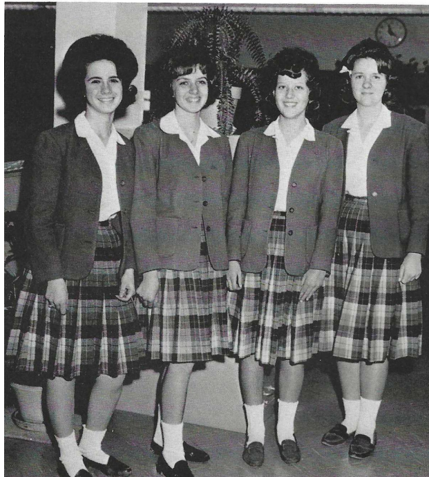
Alumni Find #3_July 2020