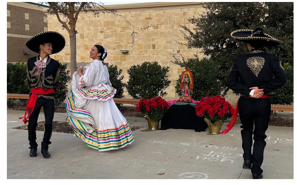
Word on Fire