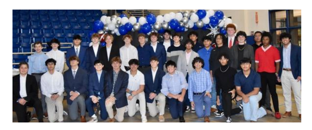
Our Lady of Guadalupe