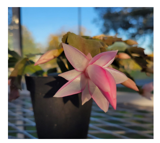
For more information and pictures about holiday cacti, click <u>here</u>.

And to add to all the confusion, these plants are called "cacti" because they don't need a lot of water, not because they come from desert habitats. They actually come from Brazilian rainforests, and share more characteristics with orchids than cacti.